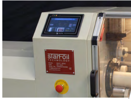
Operator's touch screen PL SACC2000

Professional semi-automatic core cutting machine, which is designed to be a cost effective unit requiring the minimum of operator intervention.