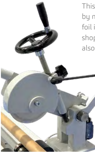
Cutting section CC1600

This high quality core cutting machine is proven by many years of experience in the hot stamping foil industry as a must for all foil consuming print shops. It is simple and reliable, easy-to-use and also suitable for foil cutting.