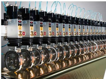
Shear slit unit

This simple and efficient Value Line Series have primarily been developed for suppliers and distributors in the hot-stamping industry, but is also very suitable for converting various flexible packaging films.