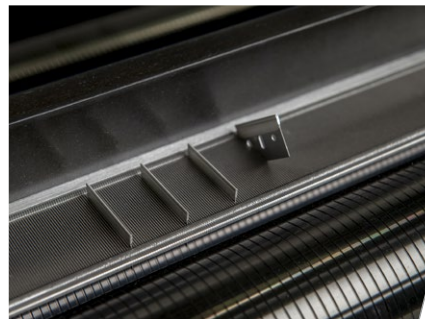
Razor blade slitting grid