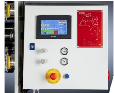
Touch screen control panel

This simple and efficient Value Line Series have primarily been developed for suppliers and distributors in the hot-stamping industry, but is also very suitable for converting various flexible packaging films.