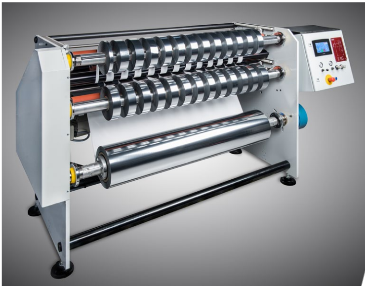
Value Line - razor blade slitting only